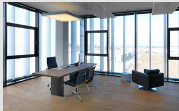
The facade elements ensure optimum levels of daylight and reduction in cooling loads whilst providing a striking aesthetic.