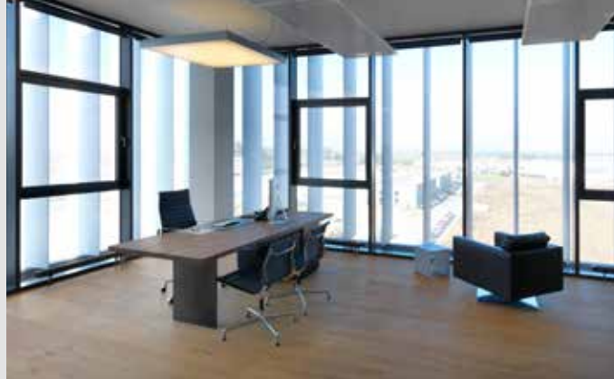
The facade elements ensure optimum levels of daylight and reduction in cooling loads whilst providing a striking aesthetic.